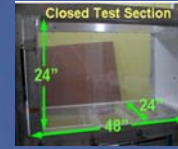
Closed Test Section