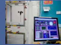
LabVIEW Data Acquisition