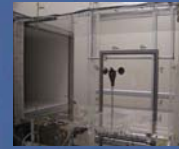
Pitot-static Tube System